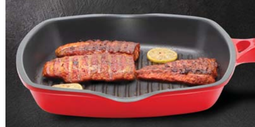
DIE-CAST GRILL PAN