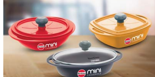
DIE-CAST MINI CASSEROLE