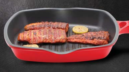
DIE-CAST GRILL PAN