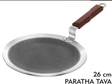
26 cm PARATHA TAVA