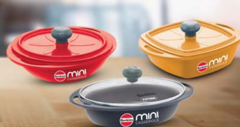
DIE-CAST MINI CASSEROLE