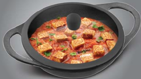
CAST IRON KADHAI