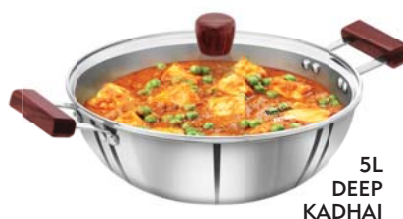
5L DEEP KADHAI