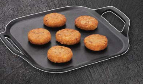
CAST IRON SQUARE TAVA