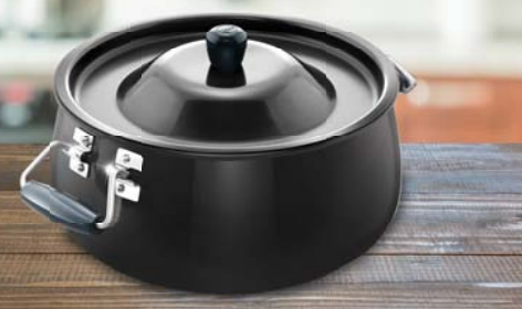
BIGBOY BIRYANI HANDI