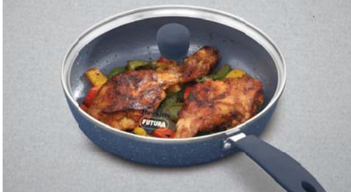
CERAMIC NONSTICK FRYING PAN